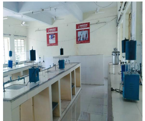
Pharmacology Lab I