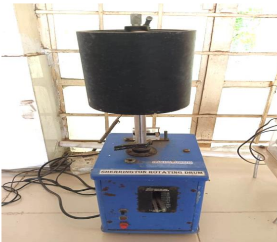
Sherrington Rotating Drum